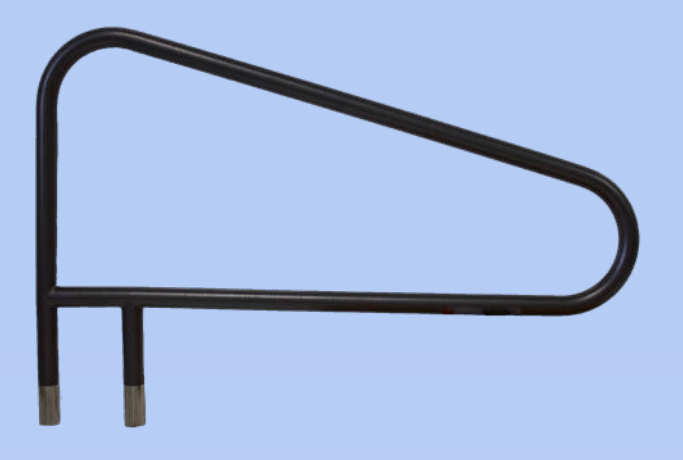
Dimensions: Length: 54" Width: 2" Height 36"