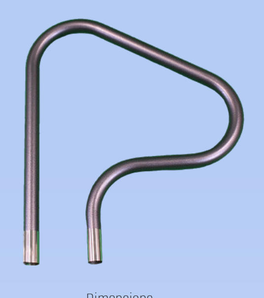
Dimensions: Length: 26"-30" Width: 2" Height: 33"-36"