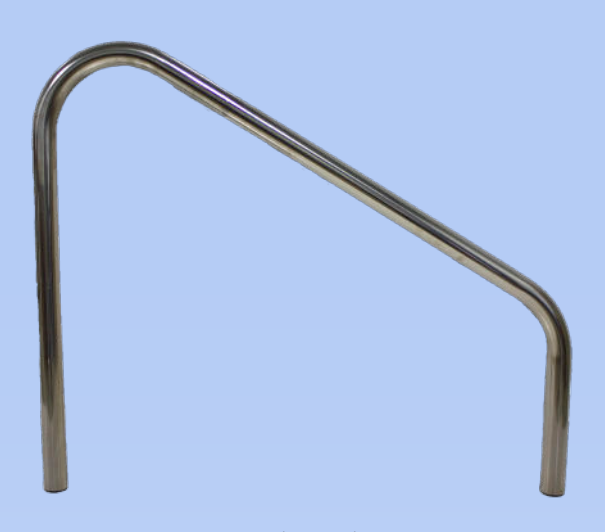
Dimensions: Length: 36"-42" Width: 2" Height 34"