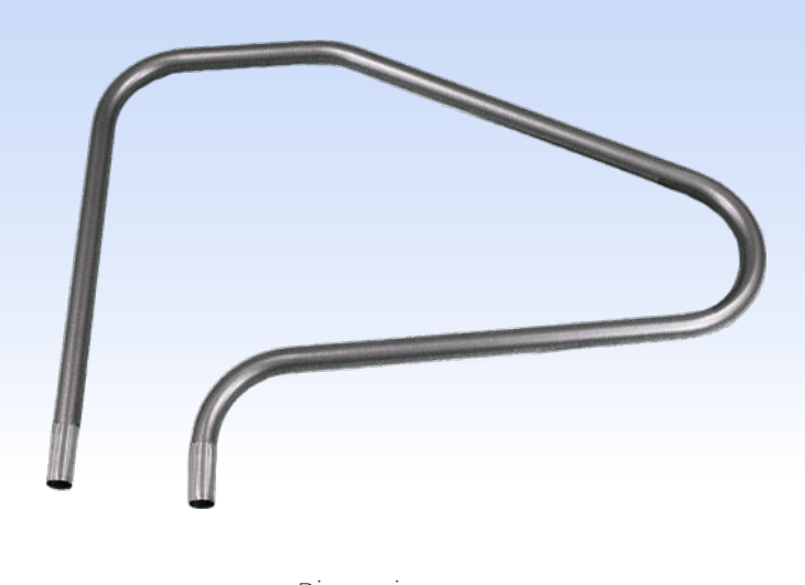
Dimensions: Width: 2" Length: 48" Height 36"