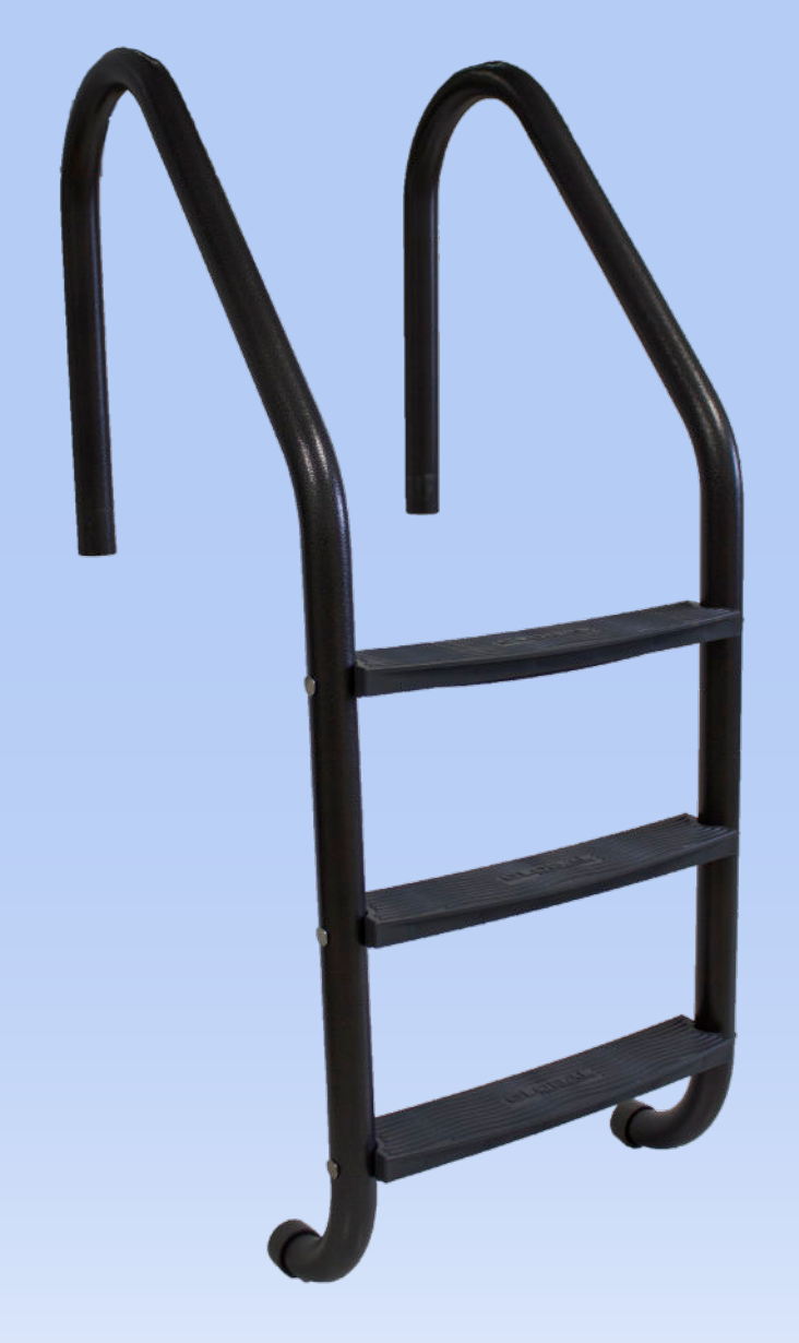
Dimensions: Length: 26" Width: 20" Height 49"-67"