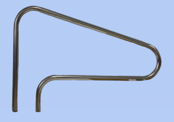
Dimensions: Length: 54" Width: 2" Height 36"